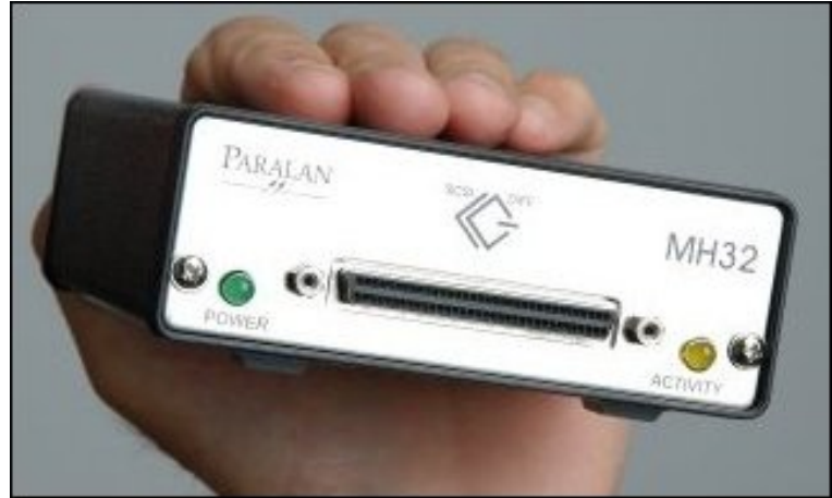
The stand-alone Model MH32A Ultra320 Converter includes a power supply for standard power line operation.